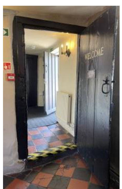
Entrance into Reception