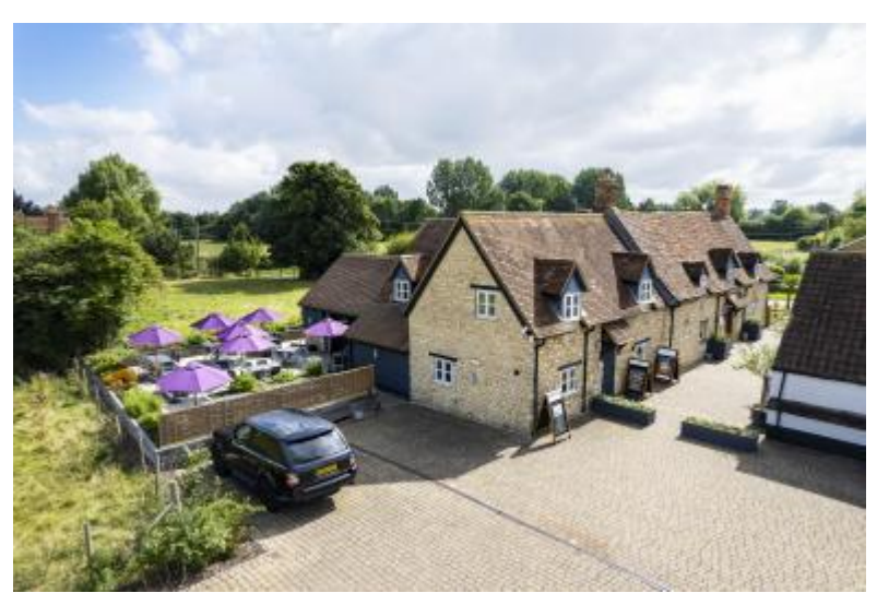
Level Access From Car Park To Entrance